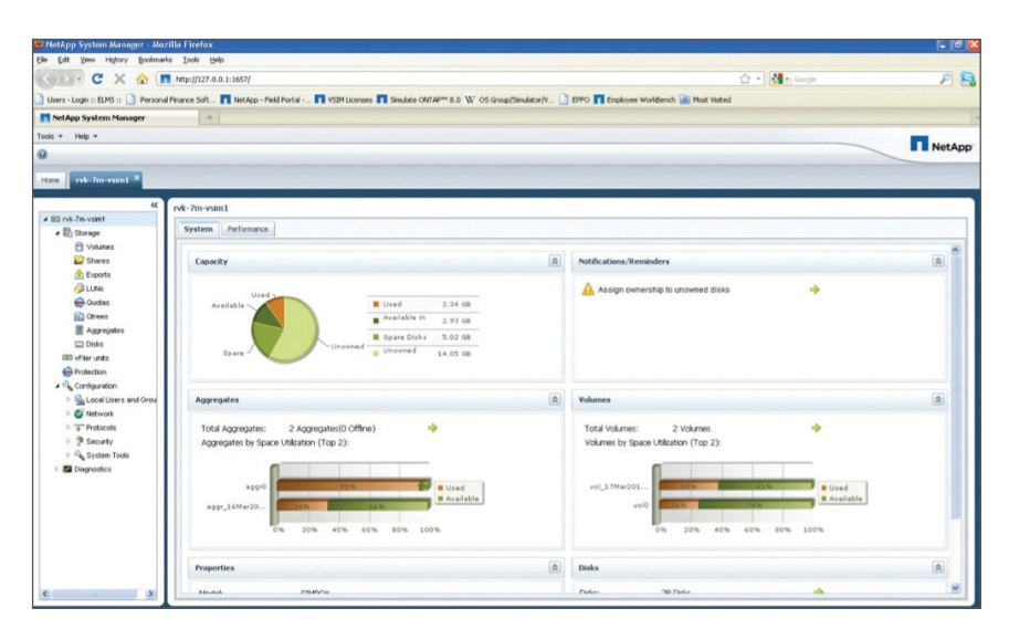
Figure 1) You don't need to be an expert to configure your storage with the simple, easy-to-use NetApp System Manager console.

Protect your critical data more efficiently with integrated data protection by using NetApp technologies such as RAID-TEC™ (triple-parity), RAID DP®, and Snapshot®.